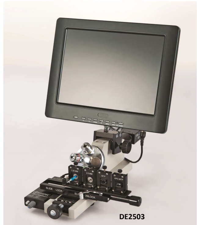
Monitor and adapters sold separately

Our Domaille Engineering OptiSpec® DE2503 video microscope is designed for large and small fiber optic cable assembly companies. The DE2503 accommodates bare fiber inspection as well as all of the standard connectors including the entire MT series of multi-fiber connectors. Blue LED illumination control eliminates previous industry standard light source issues and improves contrast on minor scratches.