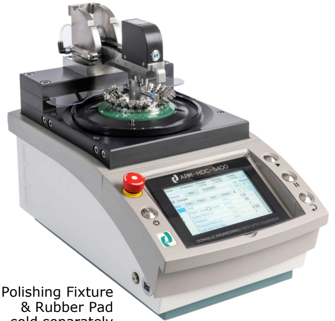
Polishing Fixture & Rubber Pad sold separately

Advancements include increased polishing pressure up to 24lbs, AbraSave+® innovation, integrated Micro-G® controls, bi-directional polishing platen, improved overarm handle and lock mechanism, illuminated arm pushbutton displaying machine status, and a built-in alert horn.