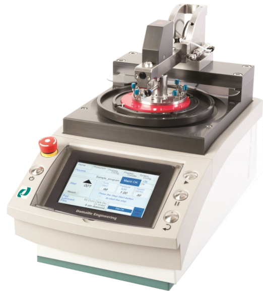
Polishing Fixture & Rubber Pad sold separately

Advancements include increased polishing pressure up to 20lbs, overarm sensor, 7" capacitive touch screen, additional language options and expanded memory.