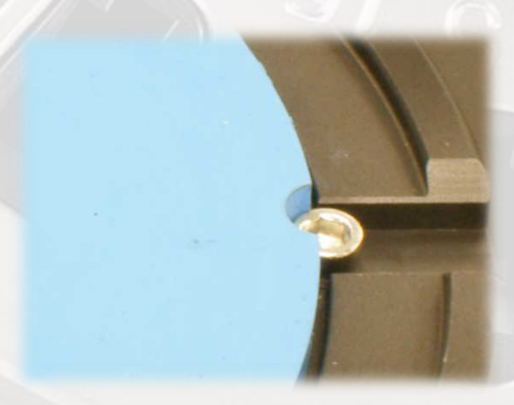
Manufactured to Domaille's exacting high quality standards